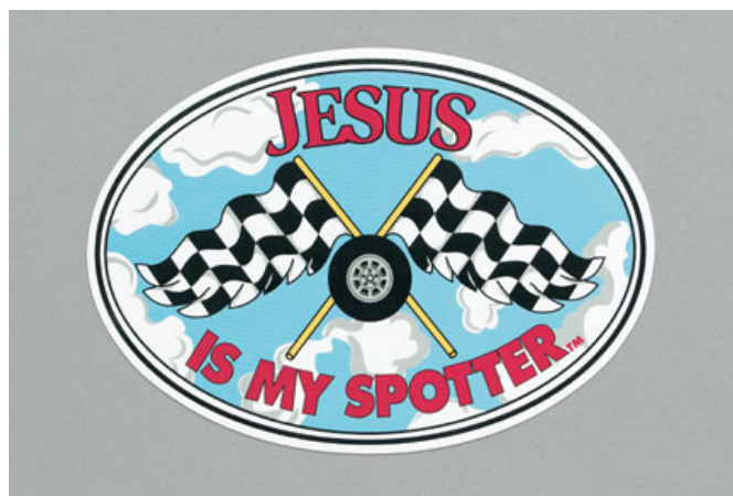
Jesus Is My Spotter Car Magnet